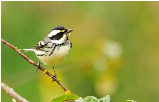
Black-throated Gray Warbler

(Note: an underscore ( _ ) must be placed in each blank space)