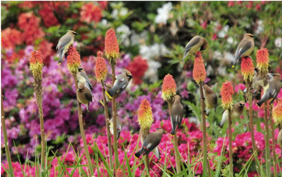
Cedar Waxing Colony