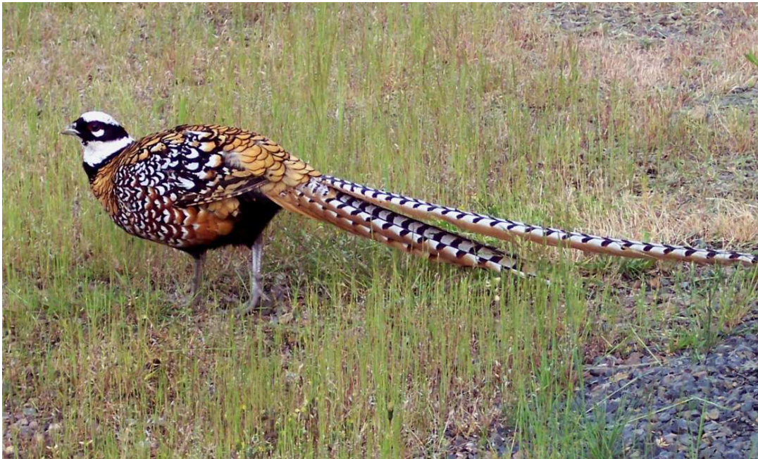
Reeve's Pheasant

We were careful not to disturb such a beautiful creature as we did our yard work, but we soon found it was not afraid of us. And after a while it even started following us around. So we fed it, and it became friendly. It