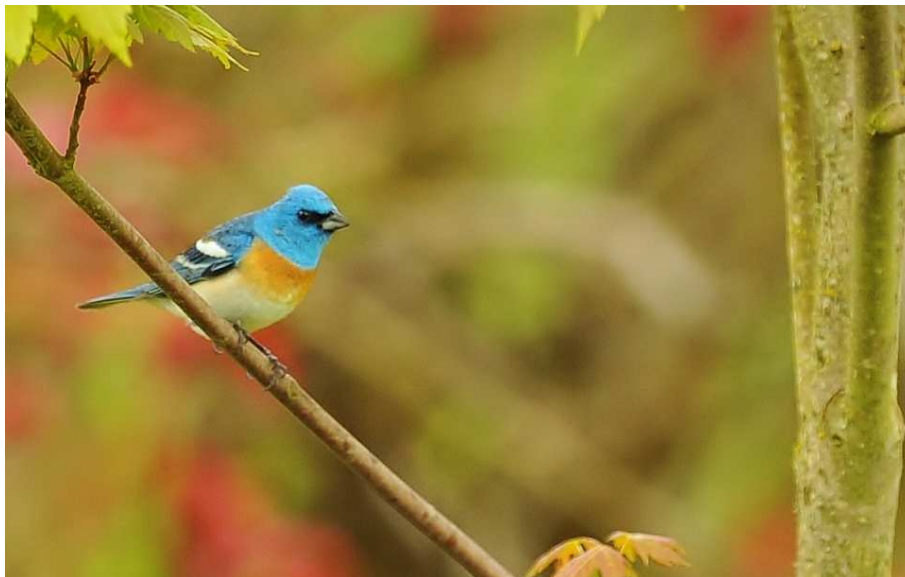
Lazuli Bunting