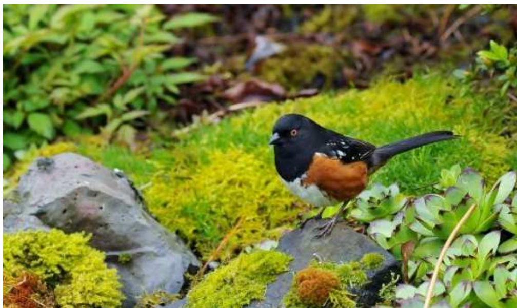
Spotted Towhee

...continued on page 4 Northern Spotted Owl