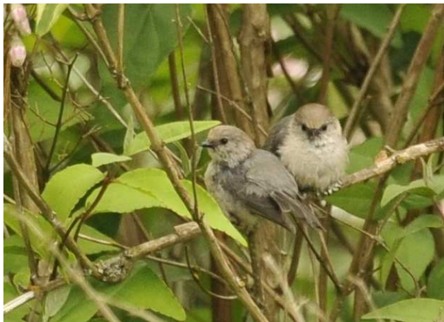
Bushtits -- Image by Royce Craig

Northern Spotted Owls continue to decline at 2.9% per year across their range. The Northwest Forest Plan has successfully protected the old growth and late successional forests that these owls need for nesting, foraging, and dispersal. However, many decades of poor stewardship of these forests have left Northern Spotted Owls vulnerable to disease, invasive