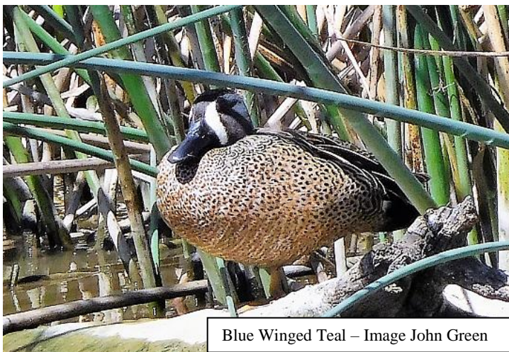
Blue Winged Teal

https://eplanning.blm.gov/epl-front-office/eplanning/projectSummary.do?methodName=renderDefaultProjectSummary&projectId=52147