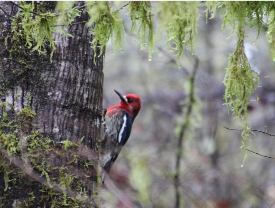
Northern Red-breasted Sapsucker seen in Castle Rock