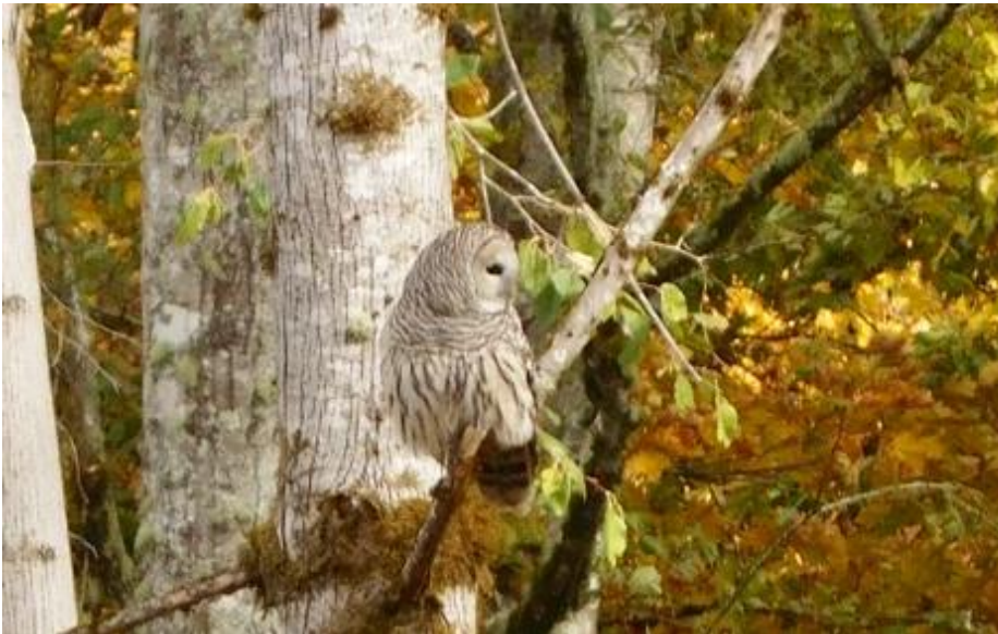
Barred Owl -- Image by John Green, seen near Olympia, Washington