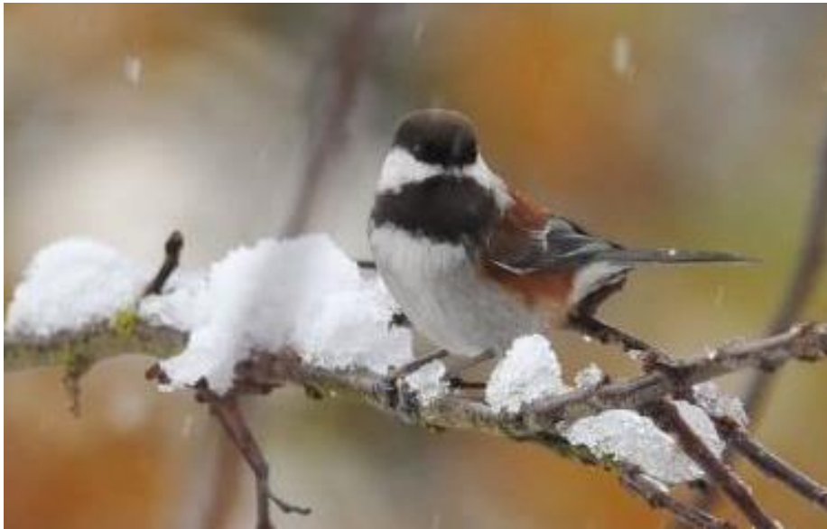
Chickadee -- Image by Royce Craig