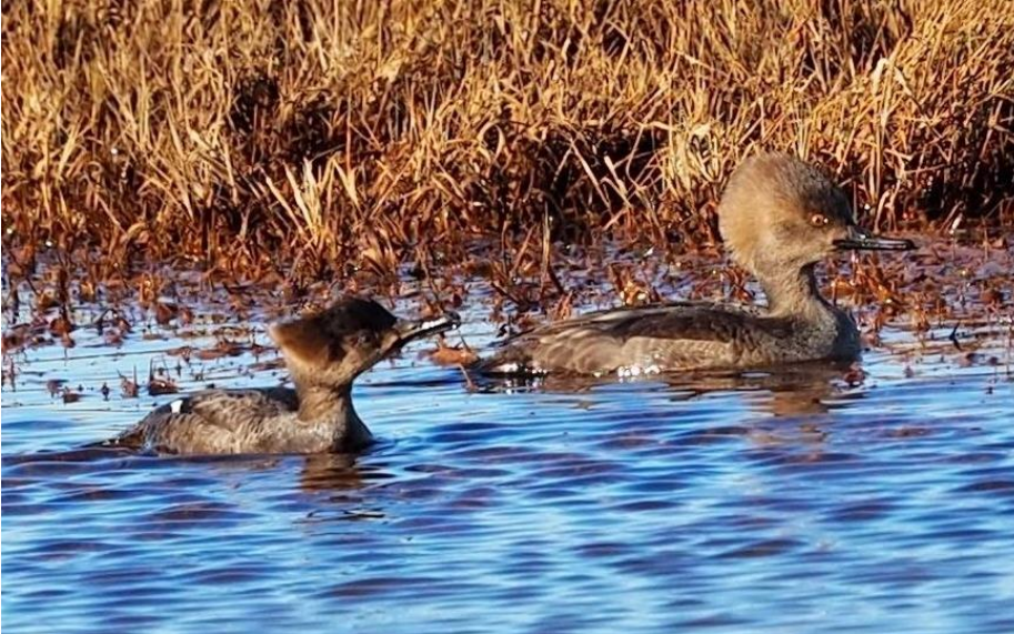
Female hooded mergansers --- Image by Kim Fields seen near South Jetty at Fort Stevens State Park