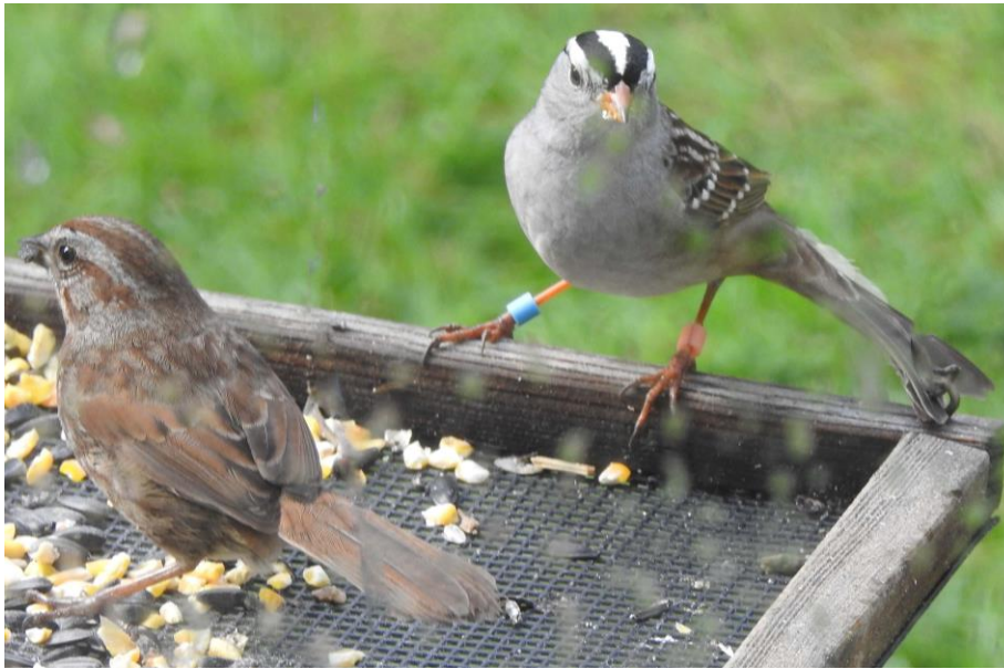
Gambles' White crowned Sparrow (see page 3)