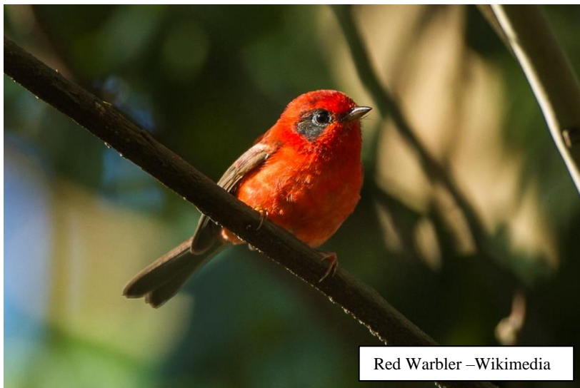
Red Warbler

As I said, we ended up at around 9500 feet by 5PM and even found a good variety at that elevation, including some we didn't see below. The air was thin, but the weather had been warm and not too hot, the skies were clear and it was a wonderful