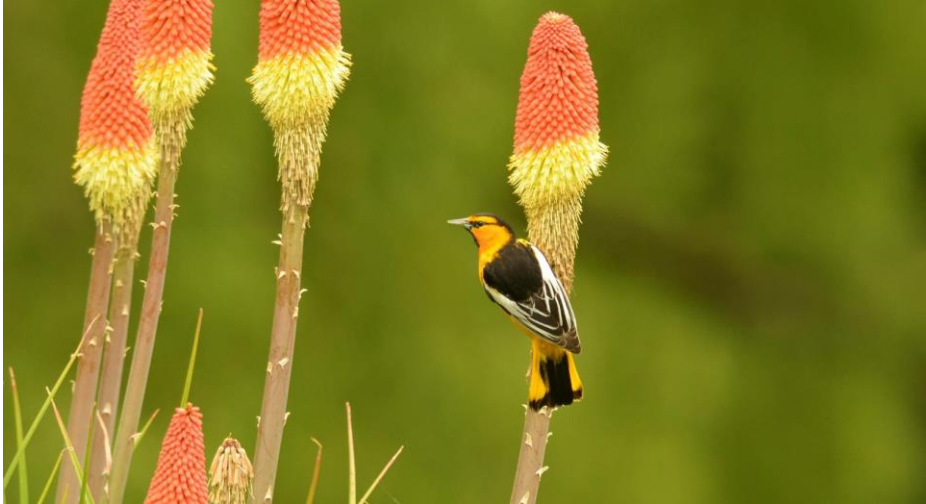
Bullock's Oriole - Image courtesy of Royce Craig