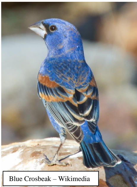
Blue Grosbeak