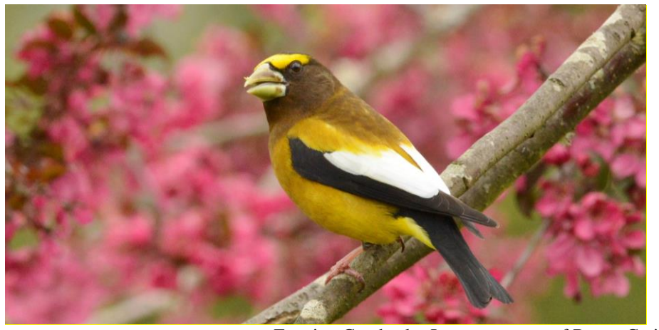
Evening Grosbeak

WHAS made changes to membership by switching to a yearly renewal date. All membership renewals are due in March, see page 2 for the details.